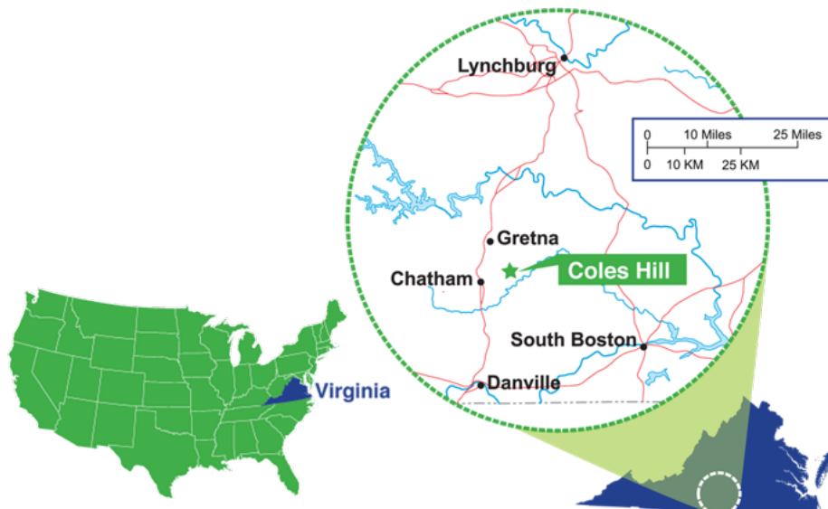
Figure 1: Coles Hill Property Location

put the deposit into production, but the project was shelved due to the drop in the price of uranium. At that time, a 5,000-ton per day open pit mine and mill was envisioned. The project lay dormant until 2007 when Virginia Uranium, Inc. drilled 12 holes to confirm the historic grades as part of the initial NI 43-101 technical report and mineral resource calculation. Development activities have ceased since late 2013. 2